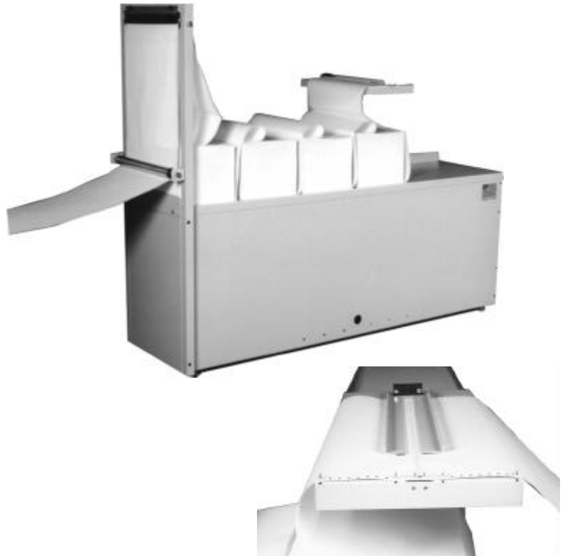
INTEGRATED SPLICING STATION

INTEGRATED SPLICING STATION - UTILIZES PINS AND A MAGNETIC BAR TO LINE UP FORMS AND HOLD THEM IN PLACE WHILE APPLYING SPLICING TAPE.